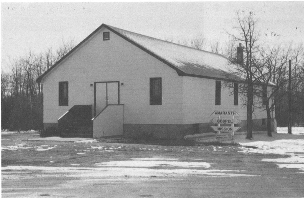
Amaranth Gospel Mission, 1981.