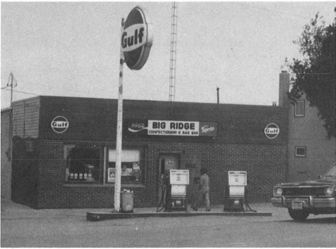
Big Ridge Store.