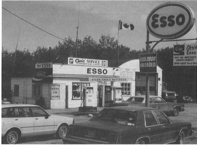
Chris' Service Esso.