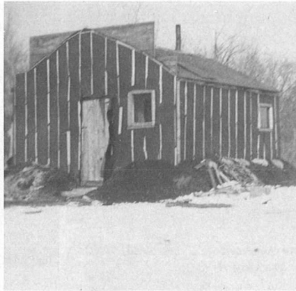
Kjartanson's fish camp.