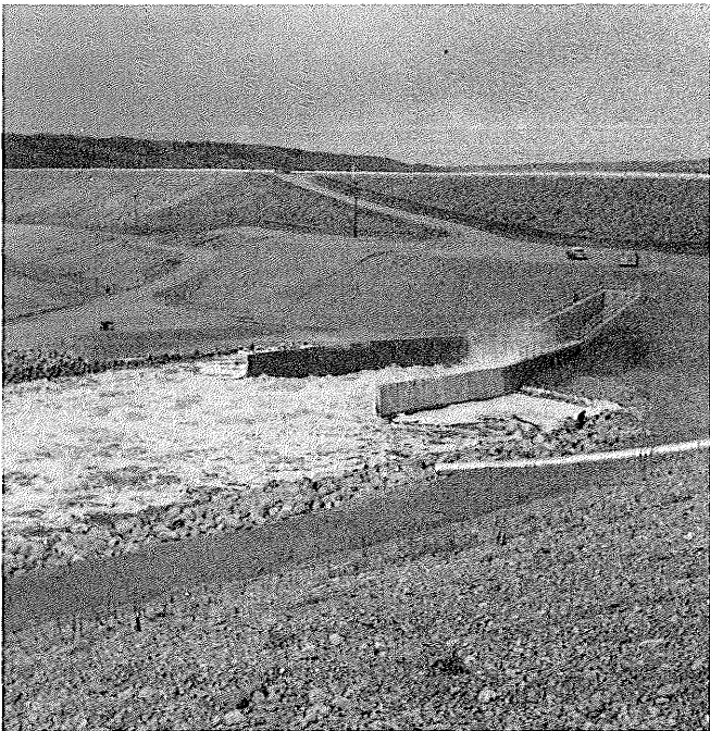
The conduit at the Shellmouth Dam - the gates that control the flow of water to the river and the level of water in the Lake of the Prairies.