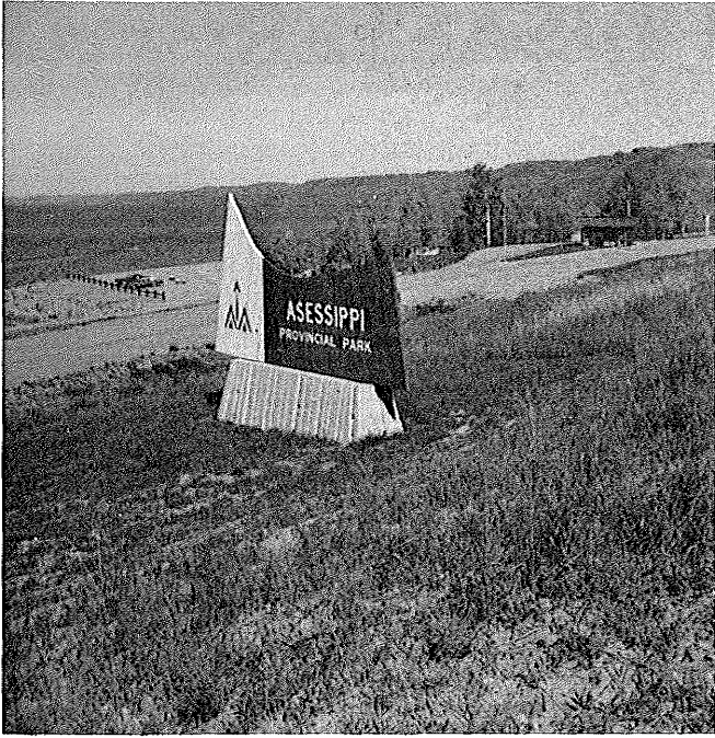
Asessippi Provincial Park - Marina and entrance gates in the background.