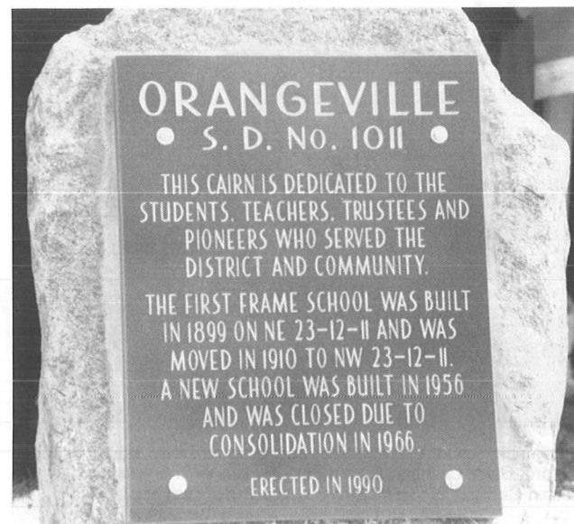
Orangeville Cairn 1990