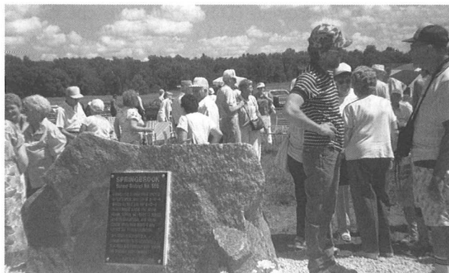
Springbrook Cairn Dedication June 30 1990

The school first opened in 1890 and 100 years later on June 30, 1990 the district gathered to dedicate a cairn in commemoration of students, teachers and pioneers who served the district and community.