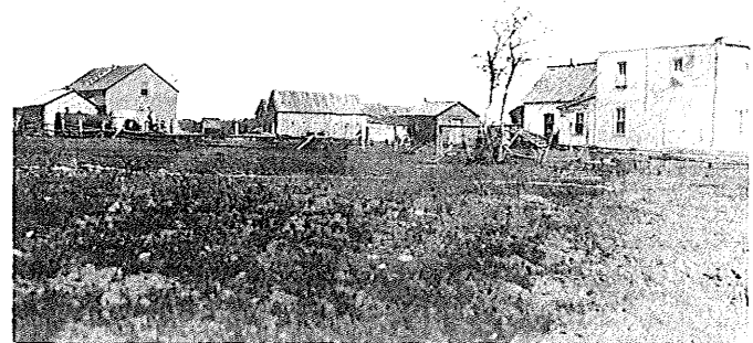
"Osi" - the home of Larus and Gudrun Bjornson. For many years a stopping place for travellers.