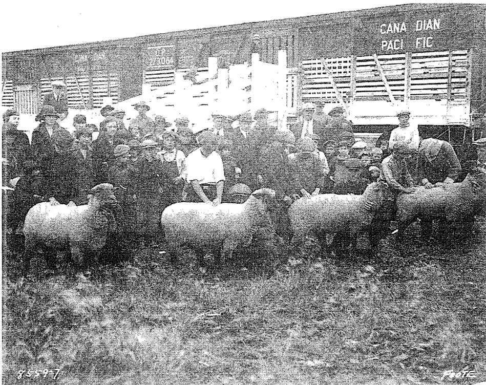
Sveinn Eyolfson with first prize sheep at a sheep sale (at right).