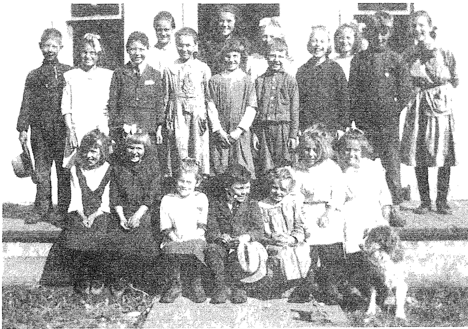
Geysir School Children - 1916