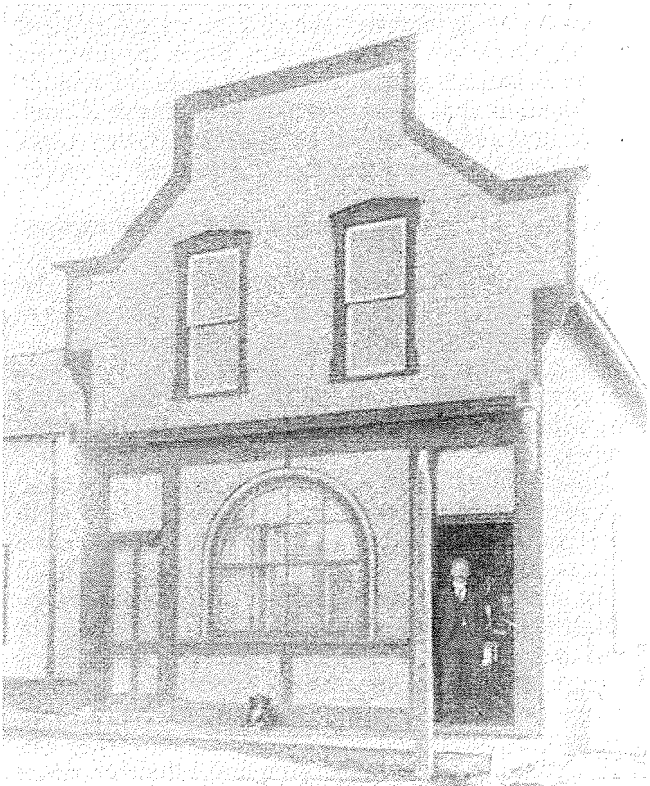
Hoppers Union Bank, c1900.

who offered their services to the public. As well, a demand arose for the need of sidewalks, repairing of streets and a firehall.