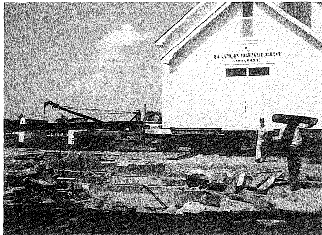
Moving the church.