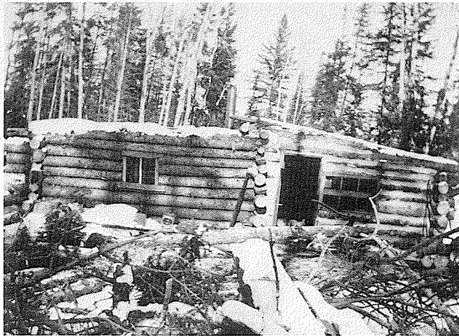
Bauschke Camp in 1934-1935.