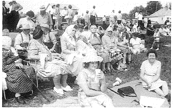
Staff and residents enjoying an afternoon at the lake, 1964.

mission to operate the Unit as a Home for senior citizens. Permission was granted and the doors opened to seniors in September 1956.