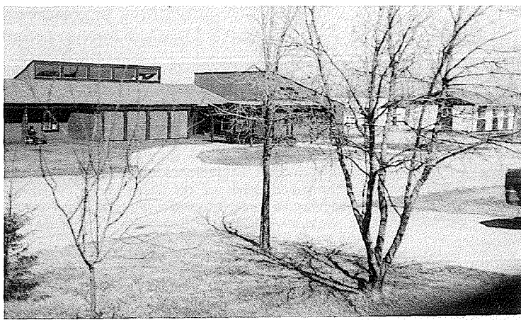
Present Medical Nursing Unit with low rental Senior Citizens homes visible on far right.

The following day the residents were entertained by the Selkirk Junior High School Band, who happened to be touring in the area. Many visitors were also in attendance and lunch was served to everyone. And somehow on this beautiful sunny day in June, the young people, their music and all the guests proved to be an excellent way to open the doors to this new residence that would become "home" to many future seniors. And it was on that opening day that the news column "Golden Reflections" was born, this "news from the Home" which is being enjoyed to the present day.